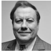
Jaloul Ayed Former Finance Minister, Tunisia